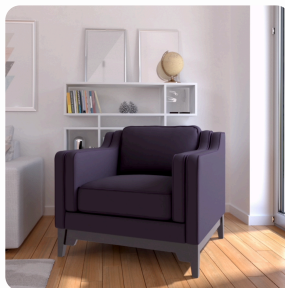
High-res virtual photography